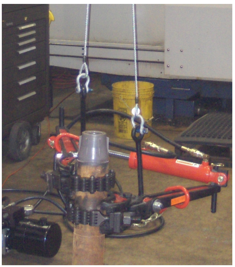
OPTIONAL HANGING ASSEMBLY FOR VERTICAL PIPE