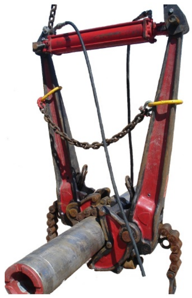
LARGER 90,000 MODEL PICTURED